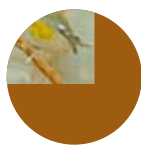
Northern Parula, photographed by Jim Burns at the Gilbert Water Ranch, AZ, January 2008, with Canon 1D body and Canon 600mm f4 lens.