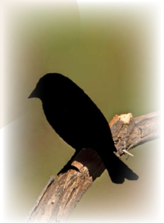
B – Tricky silhouette, difficult genus