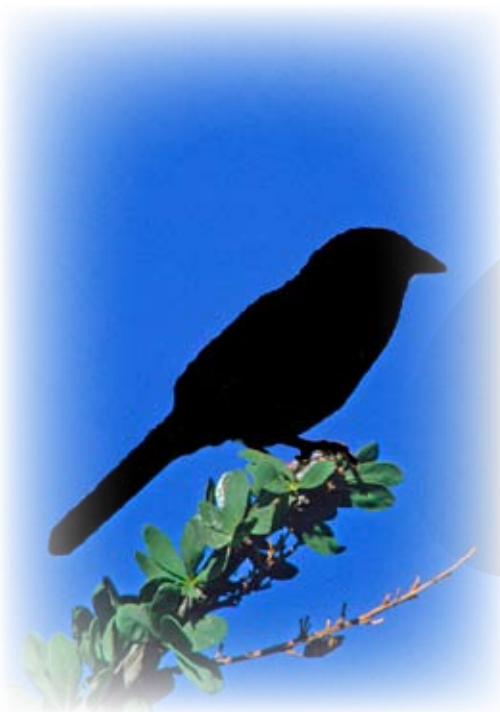
A – Good silhouette, easy genus

Here's a quote from last summer's photo quiz on warblers—"next winter, when the sparrows return, we're going to take a look at some patternless silhouettes . . . ." The sparrows have returned. It's time.