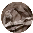
Immature Common Black-Hawk with frog; in Coconino County, AZ, August, 2006 with Canon EOS 1D body and Canon 600mm f/4 lens.

Don't forget to look over the CBC schedule and make plans to participate in at least one count this year, and sharpen your skill for the CBC season with the Photo Quiz, no peeking at the answers first is allowed. Remember the information gathered in the Christmas Counts is vital to our understanding of how the environment is being affected. Citizen science plays a vital part in what Audubon is all about.