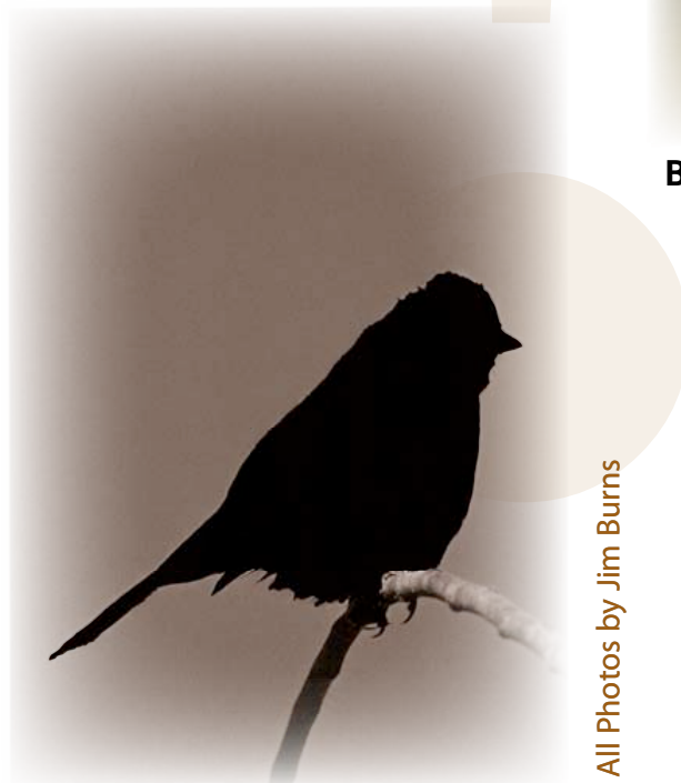
C – Good silhouette, easy genus